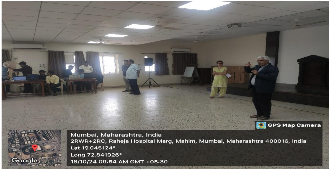
Inauguration of Mini Project Exhibition